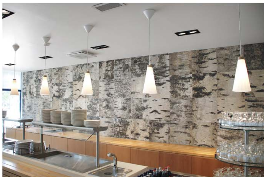
Metso Paper head office, restaurant. Architect: Architect Office JKMM Oy