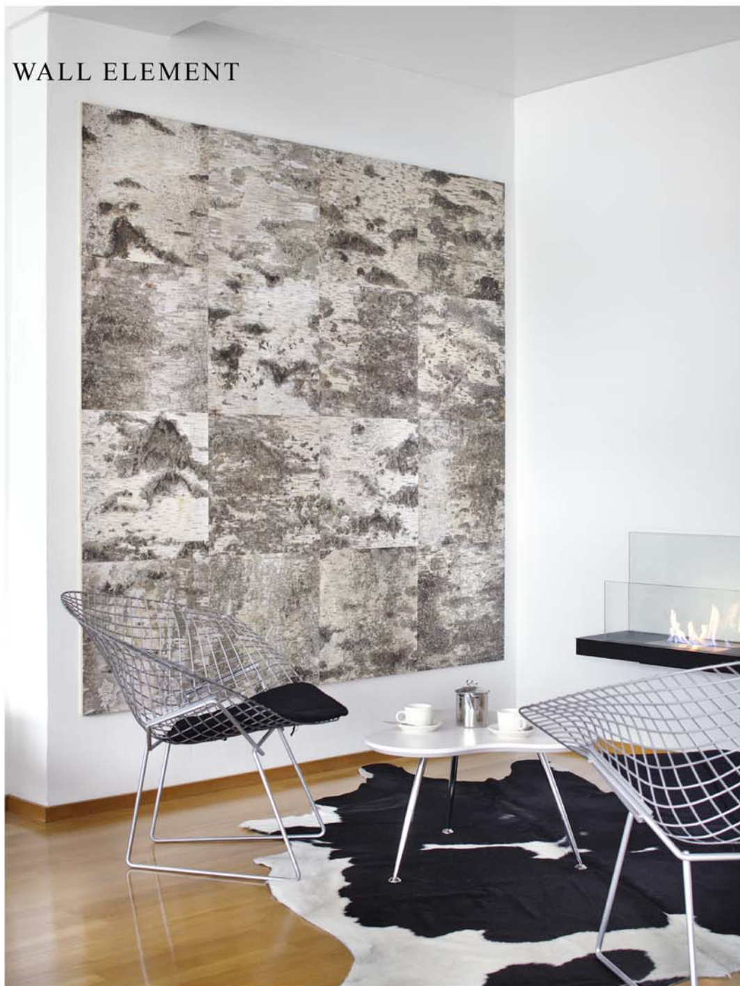
Private home. Interior: Tapio Anttila Design

Design: Tapio Anttila, interior architect SIO